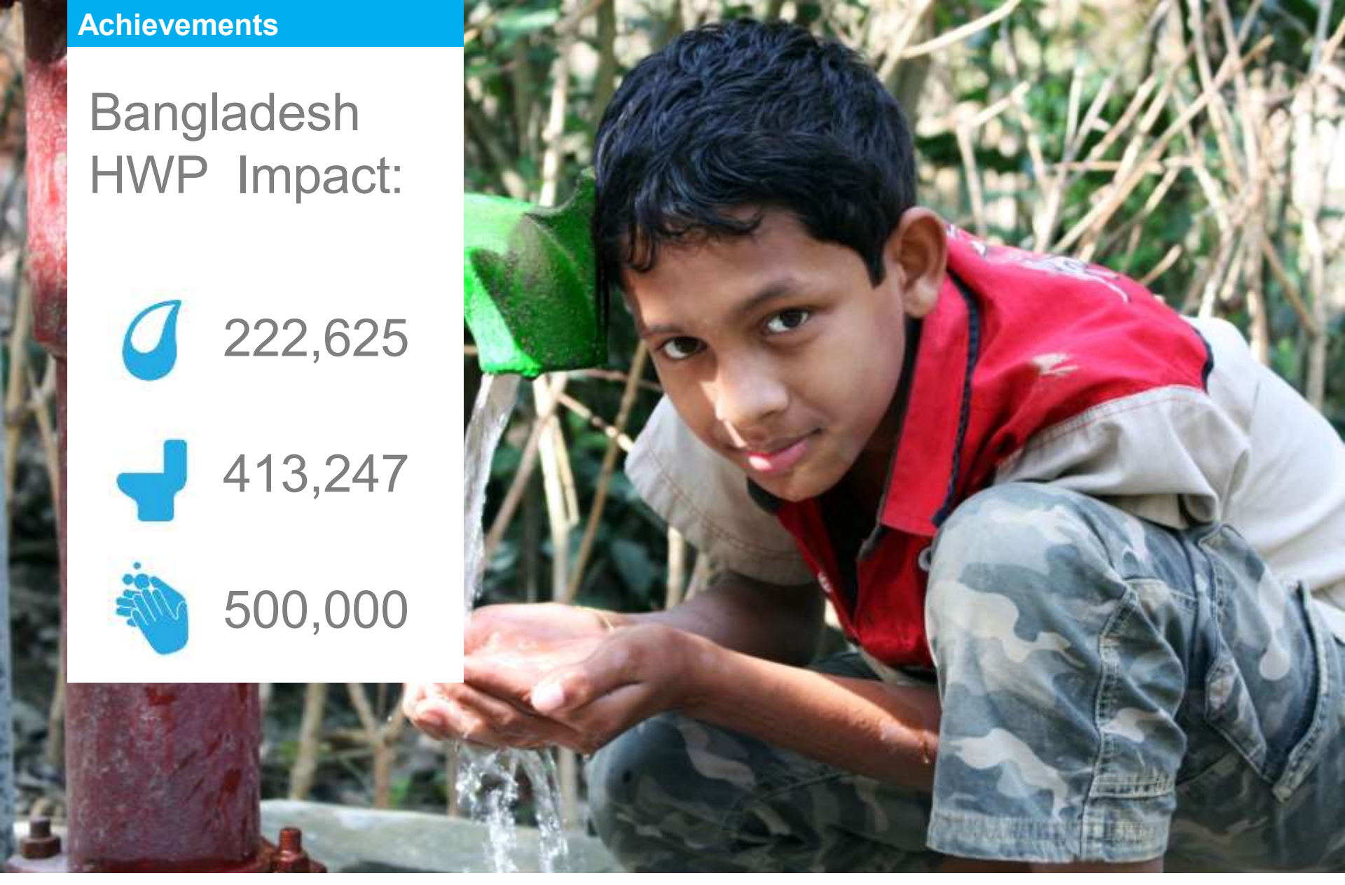
Water point arrives in a local community providing clean water.