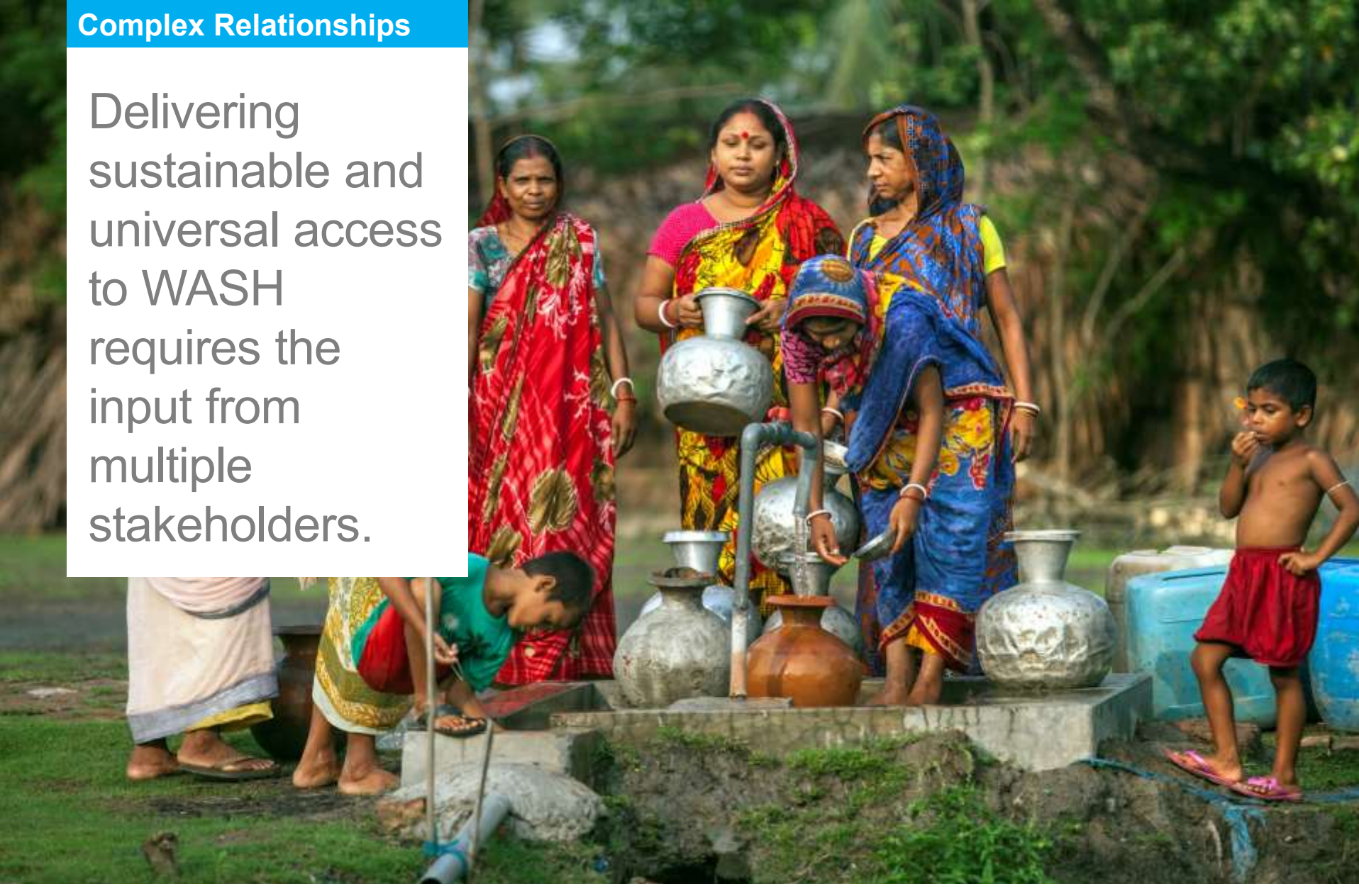
Local women collect safe, clean water from the supply point Shibbati, Bangladesh