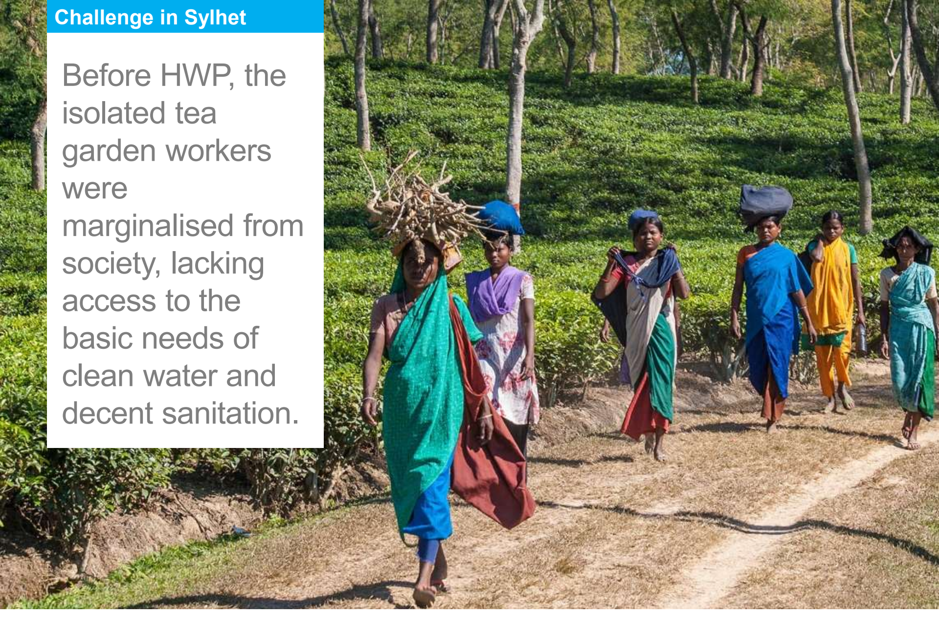
Locals from the tea garden workers \, make their way to work . \, \! \! \! \! WaterAid