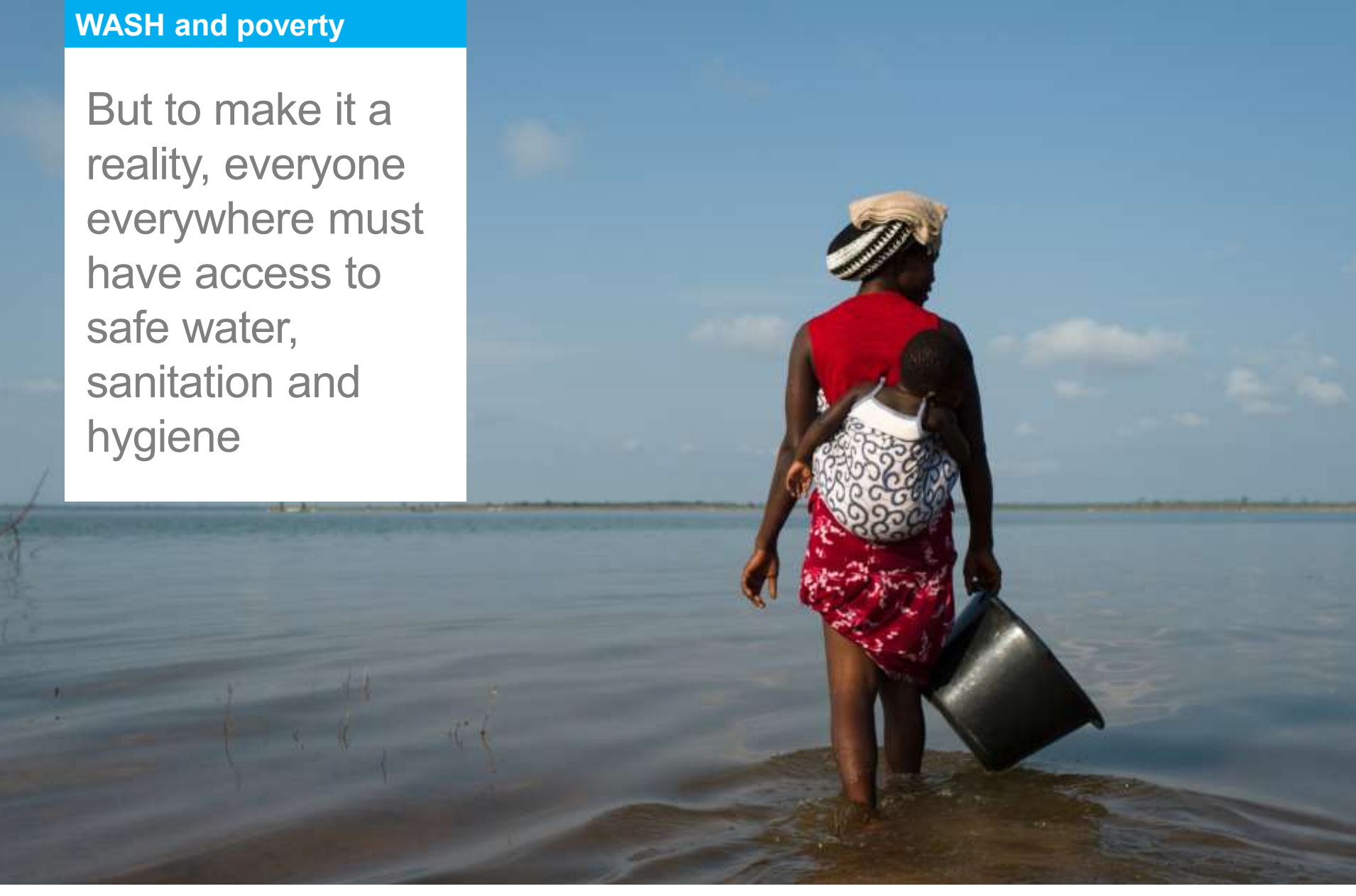
Collecting unsafe water from the Volta River in the community of Brubeng, Ghana .