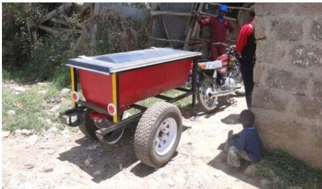
Photo 5: A second generation SaniGo; the successor model of the original handcart, in operation. (photo: D. Mbalo, 2015).

The water utility trains sanitation teams and exhaustor (sludge truck) operators in safe toilet and tank-emptying techniques, working business models, occupational health and safety and customer relations.