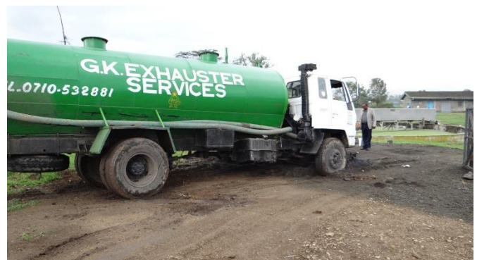
Photo 4: Large pump truck. Smaller versions are available.

Septic tanks are the most common technology (74 %) for the storage of faecal sludge. They are emptied by exhausters (photo 4).