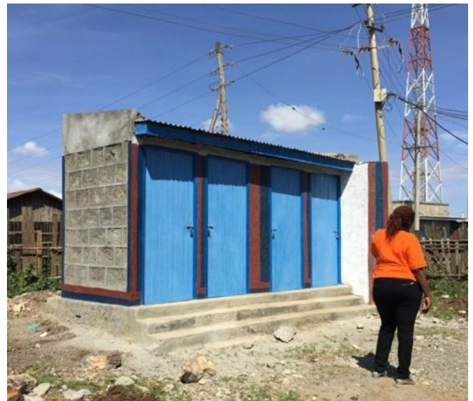
Photo 3: Row of four single vault UDDTs (photo: J. Kiptanui 2015).