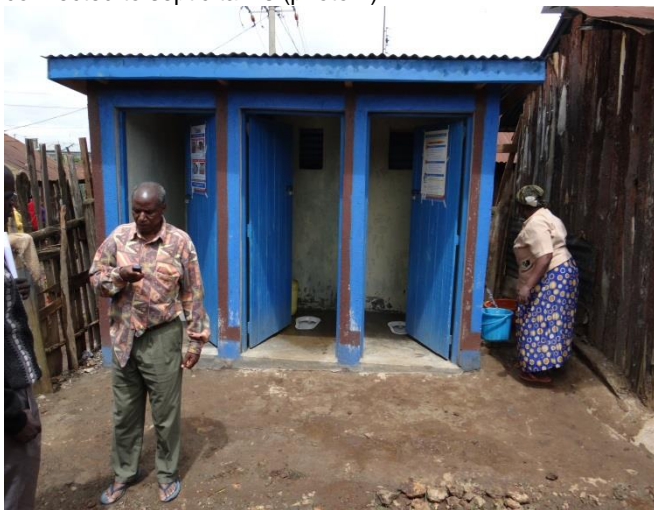
Photo 2: Landlord with three toilets constructed through UBSUP

The most popular toilets within UBSUP are pour-flush toilets connected to septic tanks (photo 2).