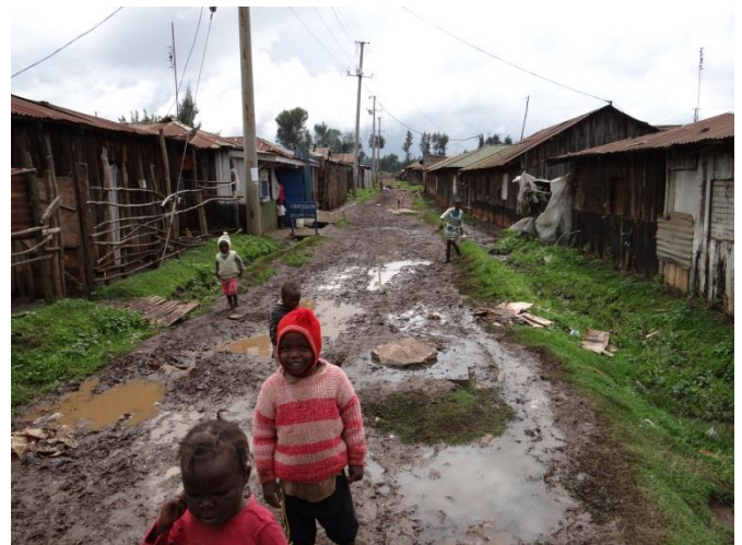
Photo. 1: Typical road in Maina Village, one of the areas where UPSUP is active, with existing sewer line

UBSUP is implemented by the Water Services Trust Fund (WSTF) Kenya and jointly financed by the Bill and Melinda Gates Foundation (BMGF) and the German Federal Ministry for Economic Cooperation and Development (BMZ) through the German Development Bank (KfW). Technical assistance to the WSTF and other sector institutions is provided by GIZ. The UPSUP programme has achieved impressive initial results in terms of scaling up access to basic sanitation for households in urban low-income areas in across the country. The GIZ Water Sector Reform Programme team in Kenya recently invited colleagues from other East African GIZ programmes for a peer review. Besides sharing lessons learnt, the objective was to gather feedback to further improve the ongoing scaling up process. This case study is an output of this peer review.