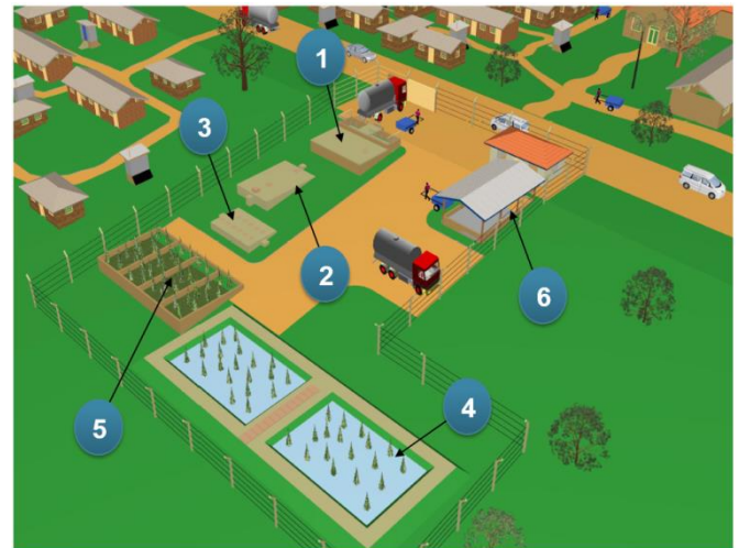
Fig. 3: Representation of a DTF with standard components highlighted.

Utilities may adapt this standard design to the local conditions (space, topography, size).