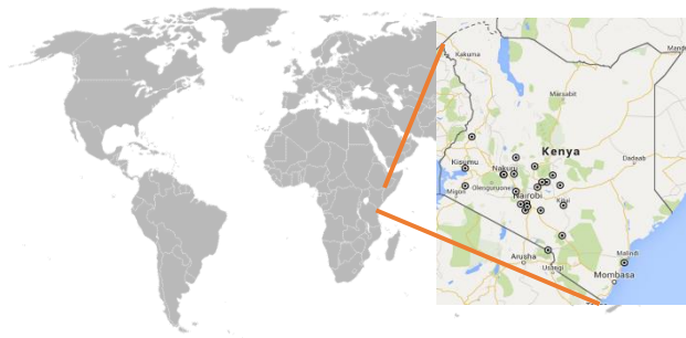
Fig. 1: Project location