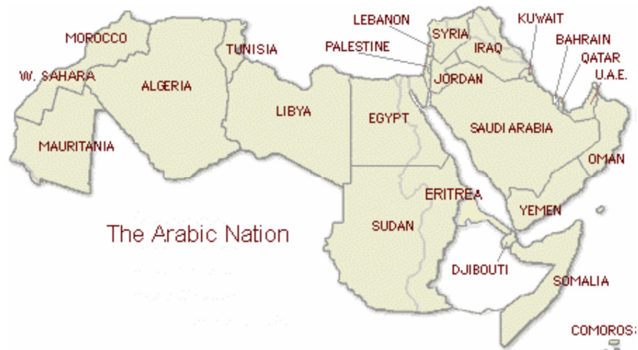
Figure 2: Arab Countries

Euphrates basin, which has a surface area of 450,000 km 2 . The Euphrates River is 2,735 km long. The river rises in Turkey and flows through Syria before entering Iraq on its way to the sea, where after it joins the Tigris, forms the Shatt al-Arab. The Tigris basin is shared by the same three riparians and with Iran as an additional basin country. The basin covers about 110,000 km 2 and the river is roughly 1,900 km long. Before the confluence of the Euphrates and Tigris, the Euphrates and Tigris flow within Iraqi territory for about 1,000 km and 1,300 km respectively (Stockholm International Water Institute (SIWI), 2009).