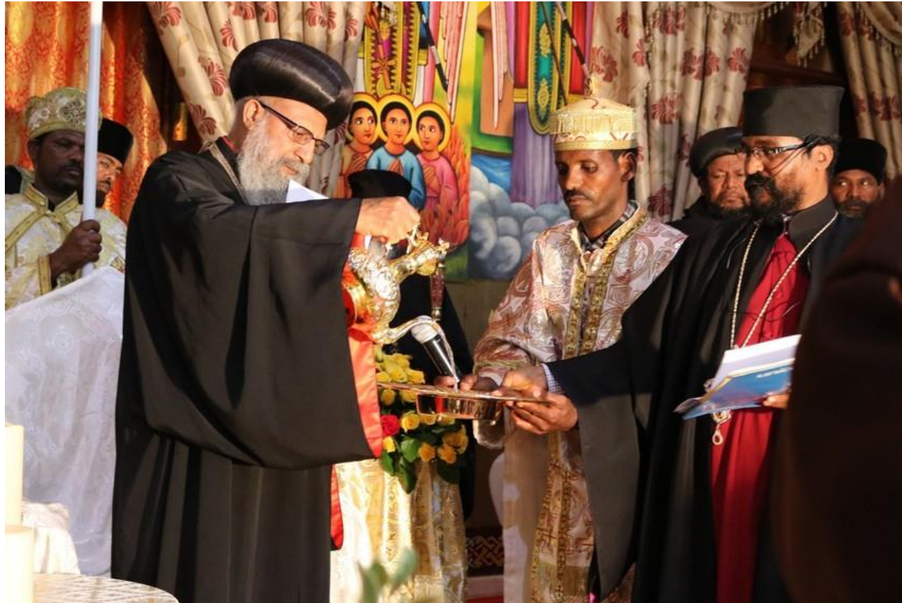
H.H. Patriarch Abune Matthias I, Patriarch of Ethiopia Inaugurating the Lenten campaign in Addis Ababa.