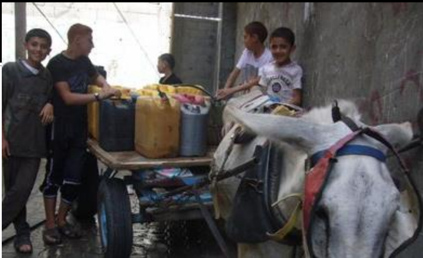
Children of Gaza fetching water...