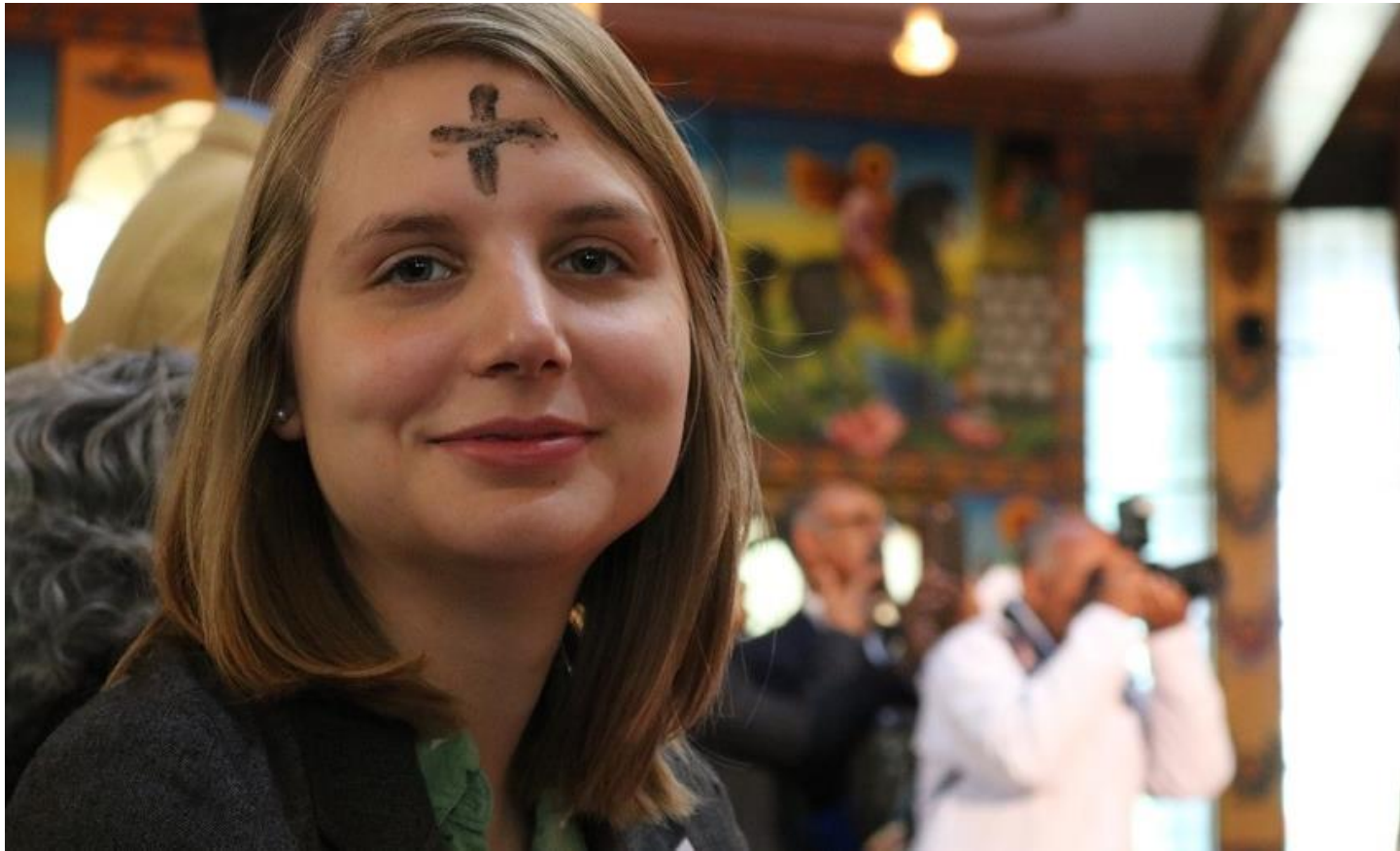
Participants after the imposition of ashes