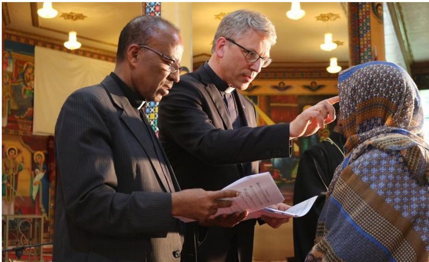
Imposition of Ashes on Ash Wednesday , 1 March 2017, Addis Ababa