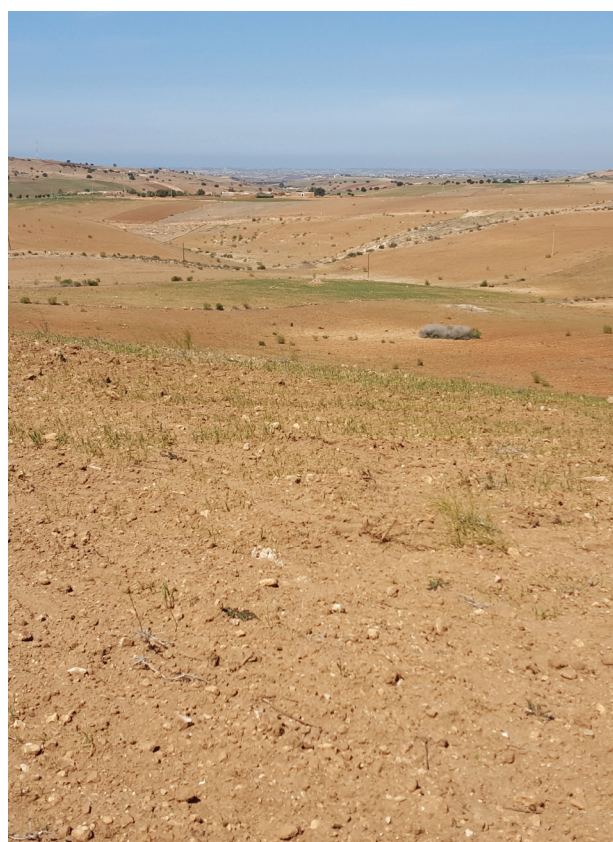
Drought in Morocco in March 2016

Thematic Area: Climate Change Impacts and Management