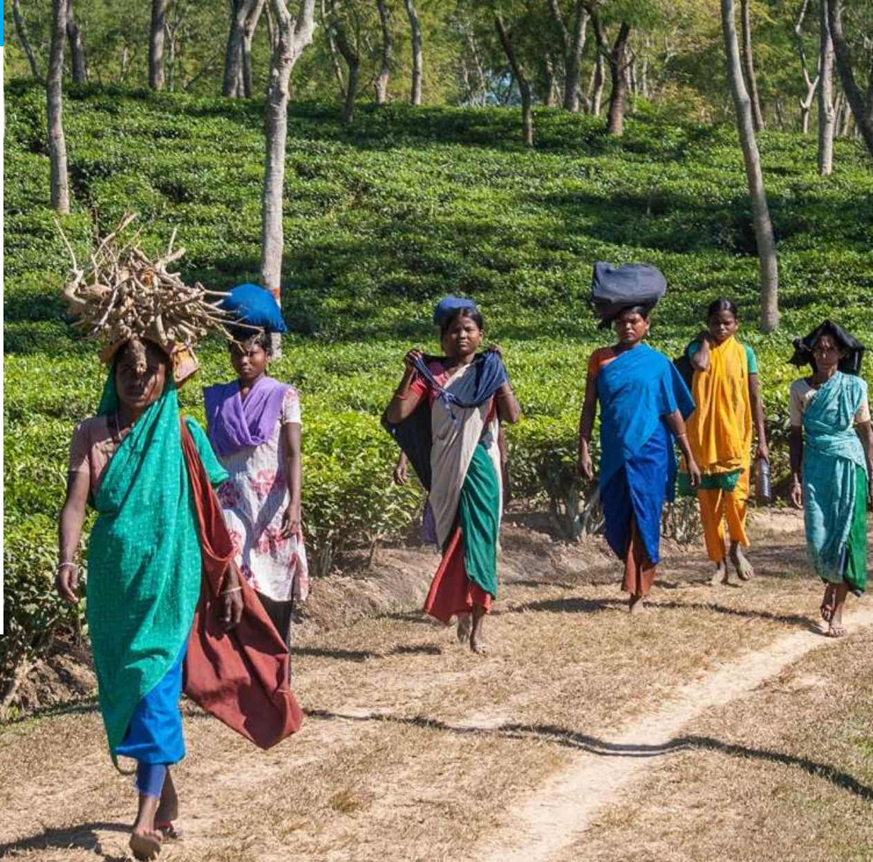
Locals from the tea garden workers make their way to work .

Before HWP, the isolated tea garden workers were marginalised from society, lacking access to the basic needs of clean water and decent sanitation.