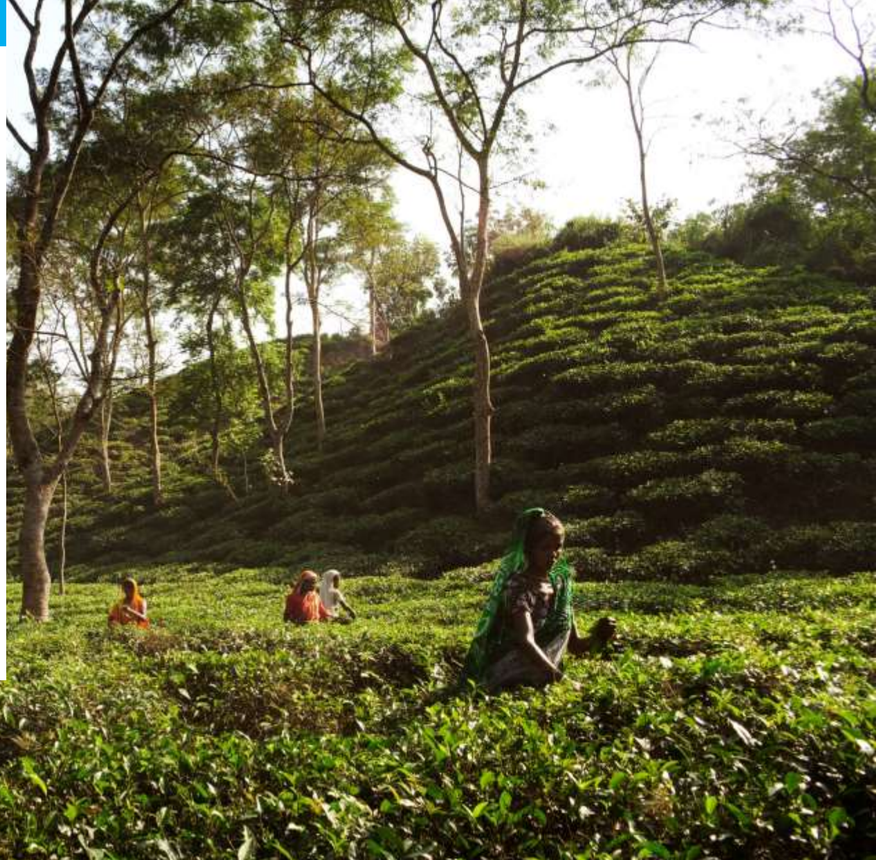
Tea pickers at work, Burjan tea garden, Sylhet, Bangladesh