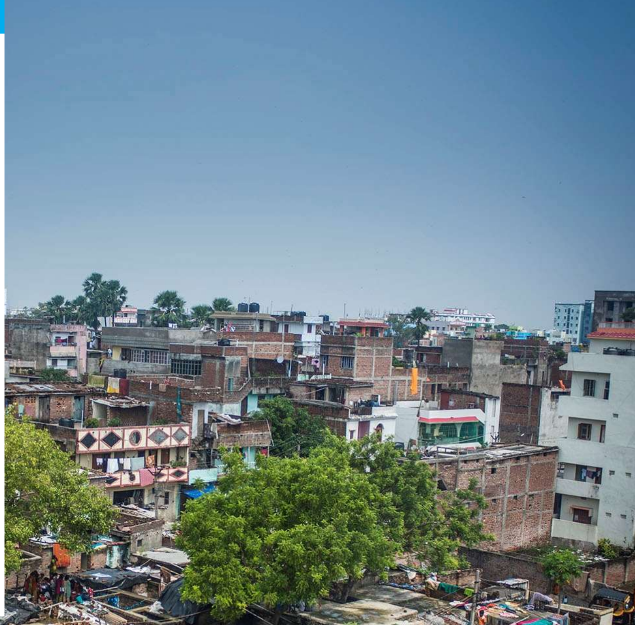
View of Mainpura slum, Patna, Bihar, India, September.

The world has committed to that ambition in the Global Goals for Sustainable Development.