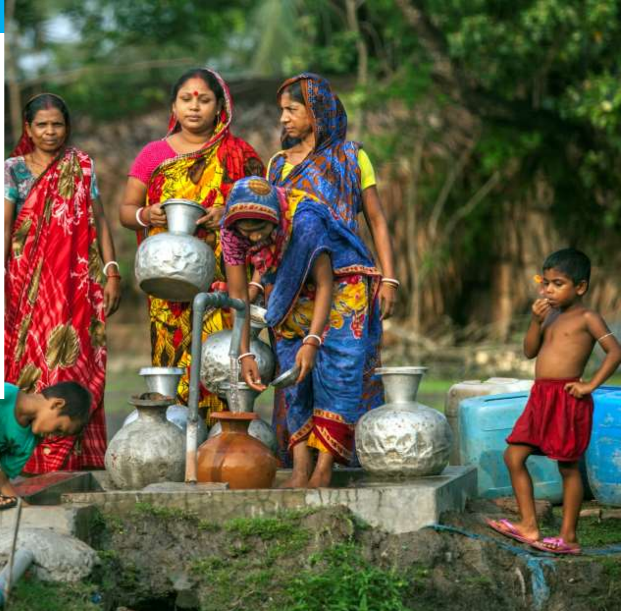
Local women collect safe, clean water from the supply point Shibati, Bangladesh

Delivering sustainable and universal access to WASH requires the input from multiple stakeholders.