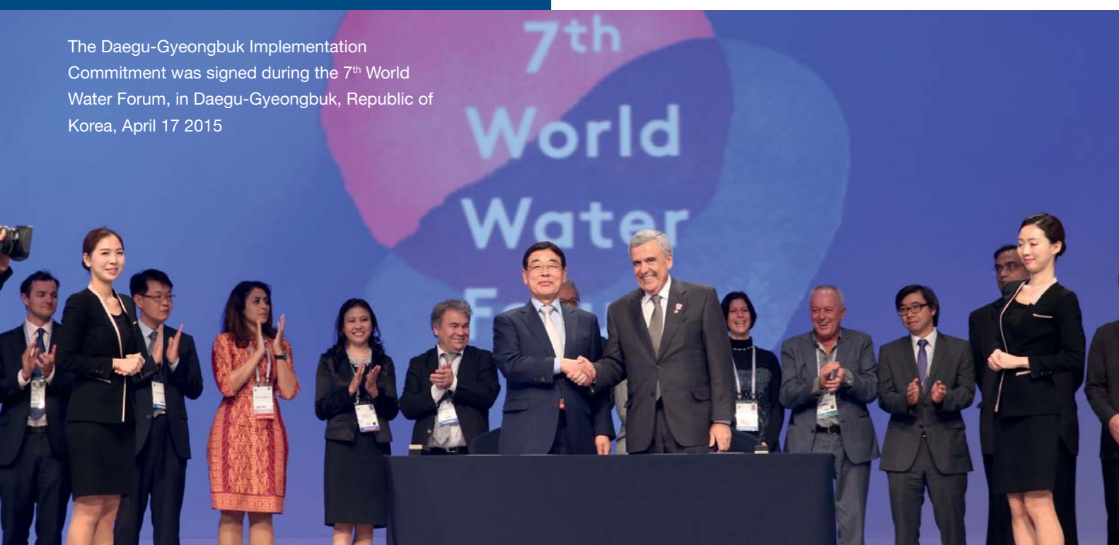
The Daegu-Gyeongbuk Implementation Commitment was signed during the 7 th World Water Forum, in Daegu-Gyeongbuk, Republic of Korea, April 17 2015

For a full list of Champions and Core Group Members visit the Action Monitoring System website: ams.worldwaterforum7.org