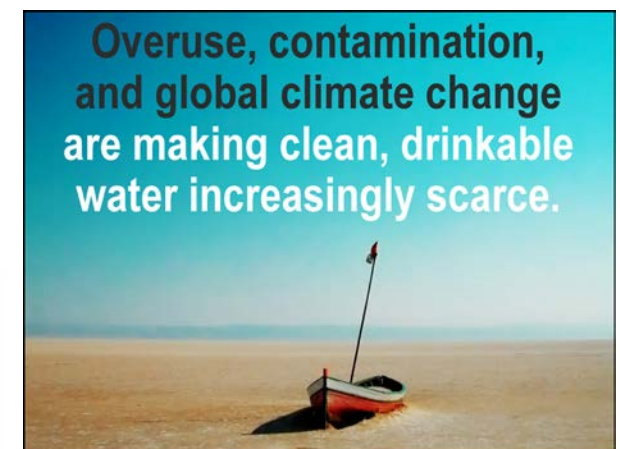
Frames from "Downstream" video, WaterReuse Research Foundation WRRF 09-01