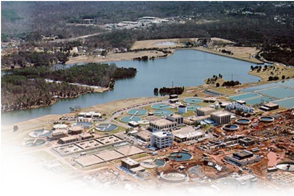
Upper Occoquan Service Authority: world's first and largest indirect potable reuse plant