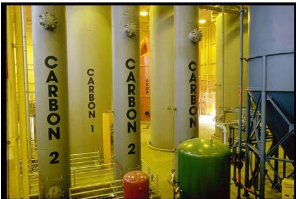
Two-stage granular activated carbon adsorption contactors at Denver Potable Reuse Demonstration Plant

When water quality studies indicated the 32 million-cubic meter Occoquan Reservoir was seriously degraded, the major source of drinking water for the million+ people in the Fairfax County/Washington DC area was at risk. The problem had developed as a result of inadequately treated sewage discharged from 11 small wastewater treatment plants upstream of the reservoir. While one solution would have been to expel all wastewater out of the Occoquan watershed so it wouldn't pass through the reservoir, this would have been extremely expensive. Instead, CH2M recommended that the dozen small wastewater treatment plants be replaced with one regional wastewater treatment plant; and that the new plant use advanced treatment methods to produce near-drinking-water quality effluent that could be released to the reservoir upstream of a drinking water plant. This cost-effective approach and rigorous design requirements once again raised the bar for wastewater treatment, including reliability and process advances. The cost savings afforded by biological treatment helped minimize costs (the more expensive physical-chemical processes were only used to augment treatment once biological treatment had removed conventional pollutants). CH2M has continued to provide engineering services for 40 years to UOSA, and the reservoir water quality remains high.