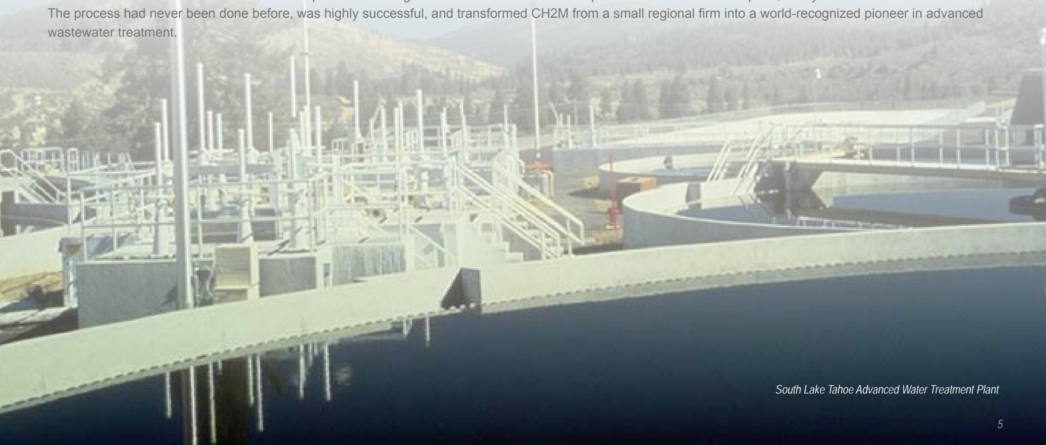
South Lake Tahoe Advanced Water Treatment Plant

Before South Lake Tahoe, wastewater was treated to simply remove biochemical oxygen demand (BOD) and total suspended solids (TSS) to minimize impacts on aquatic life in receiving bodies. CH2M had done a lot of work along those lines, winning recognition for finding new ways to filter water and clean up rivers after World War II. It was the firm's leadership in filtration that prompted the South Tahoe Public Utility to ask for its help to restore the water in Lake Tahoe to its original pristine state. Development and recreational activities had degraded the lake through the proliferation of nitrogen and phosphorus. The question was: How could the water be purified to restore it to its original unadulterated quality? CH2M conducted an extensive pilot study to answer that question. First-ever processes took the understanding of water quality to new levels, enabling engineers to create new processes to remove more organic contaminants. Phosphorus and trace metals were extracted through high lime treatment that raised the pH of the water. The process turned soluble ammonia into a gas, then ran it through an air stripper to remove the ammonia. The water was then polished with a granular media filter and further polished with carbon absorption, finally released to another lake. The process had never been done before, was highly successful, and transformed CH2M from a small regional firm into a world-recognized pioneer in advanced wastewater treatment.